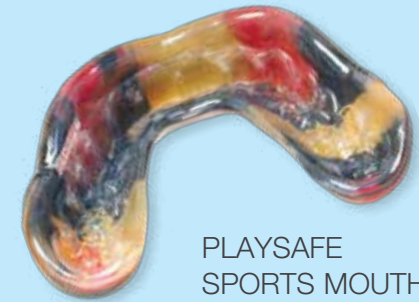
PLAYSAFE SPORTS MOUTHGUARD

PlaySafe sports mouthguards provide superior fit and retention compared to boil-and-bite mouthguards. Available in six levels of protection, the mouthguards range from one to three layers of laminated ethylvinylacetate material with a final occlusal thickness between 3 mm and 5 mm. PlaySafe mouthguards can be customized with stickers and team logos, and are available in a variety of colors to fit the personality of every star athlete in your practice!